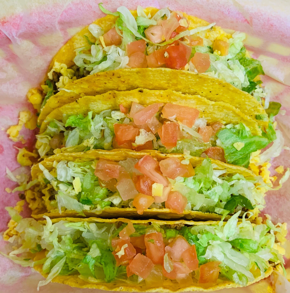
CRISPY MEAT TACOS